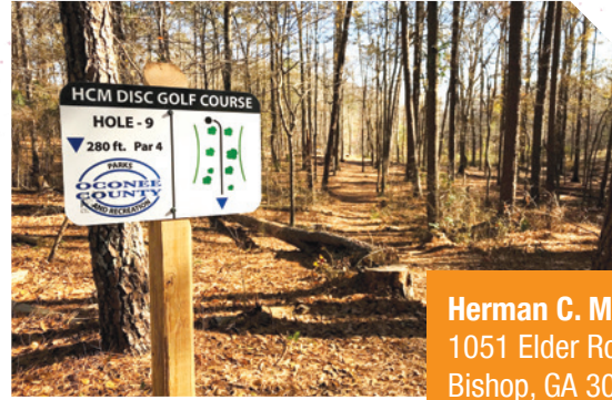
Herman C. Michael Park (HCM) 1051 Elder Road Bishop, GA 30621