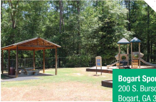
Bogart Sports Complex (BSC) 200 S. Burson Avenue Bogart, GA 30622

Oconee County has over 600 acres of parkland to enjoy. Park amenities include ball fields, tennis courts, picnic shelters, playgrounds, walking paths, trails, a Community Center, a disc golf course, meeting rooms, outdoor volleyball court, dog park, pickleball courts, and more.