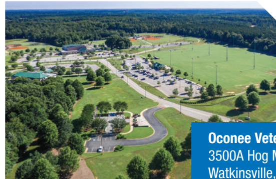
Oconee Veterans Park (OVP) 3500A Hog Mountain Road Watkinsville, GA 30677