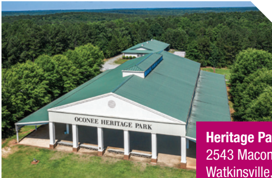
Heritage Park (HP) 2543 Macon Highway Watkinsville, GA 30677