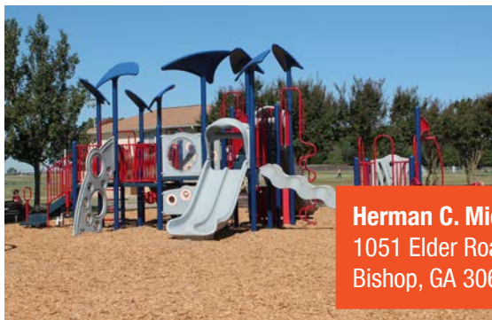
Herman C. Michael Park (HCM) 1051 Elder Road Bishop, GA 30621