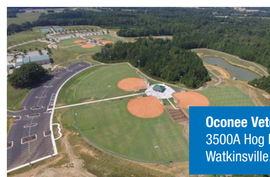
Oconee Veterans Park (OVP) 3500A Hog Mountain Road Watkinsville, GA 30677