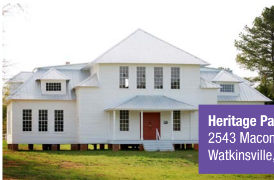
Heritage Park (HP) 2543 Macon Highway Watkinsville, GA 30677