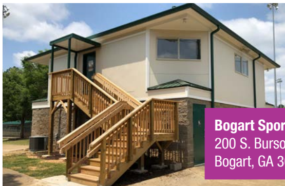
Bogart Sports Complex (BSC) 200 S. Burson Avenue Bogart, GA 30622

Oconee County has over 600 acres of parkland to enjoy. Park amenities include ball fields, tennis courts, picnic shelters, playgrounds, walking paths, trails, Community Center, disc golf course, meeting rooms, outdoor volleyball court, dog park, pickleball courts, and more.