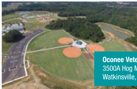
Oconee Veterans Park (OVP) 3500A Hog Mountain Road Watkinsville, GA 30677