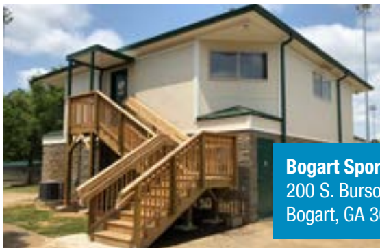
Bogart Sports Complex (BSC) 200 S. Burson Avenue Bogart, GA 30622

Oconee County has over 600 acres of parkland to enjoy. Park amenities include ball fields, tennis courts, picnic shelters, playgrounds, walking paths, trails, a Community Center, a disc golf course, meeting rooms, outdoor volleyball court, dog park, pickleball courts, and more.