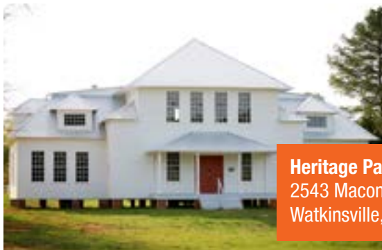
Heritage Park (HP) 2543 Macon Highway Watkinsville, GA 30677