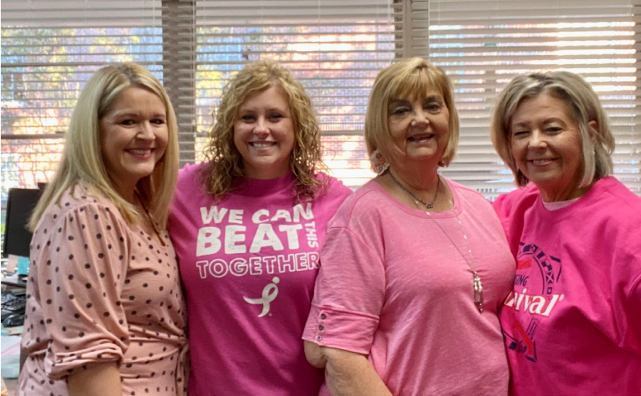
Election staff dressed in pink during Breast Cancer Awareness Month in October.

Thanks to everyone in Elections for taking the time to raise awareness about the effects of breast cancer, while also running a super-efficient advance voting system at the Civic Center!