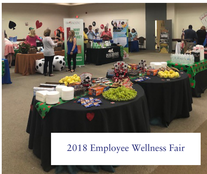
2018 Employee Wellness Fair

Don't miss out on this great opportunity to make your health a priority!